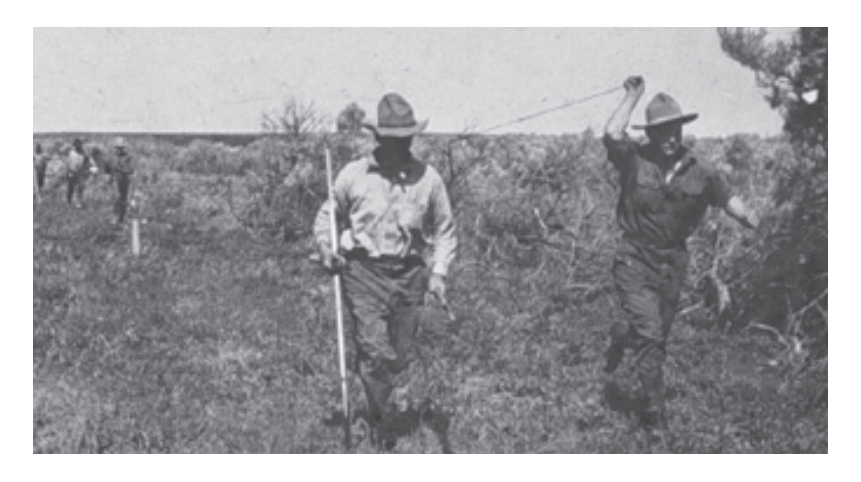
↑ Photo 1: Historical Survey Tape Measurement

It may be assumed that a 4-mile geomatics survey span is bounded by endpoints where one or more specific pipes can be visually identified, such as at valve risers. However, with typical pipeline valve spacing of up to