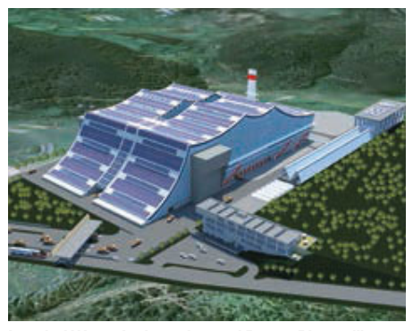
Istanbul Waste Incineration and Power Plant will provide sustainable maximum efficiency electricity. Credit: Stantec