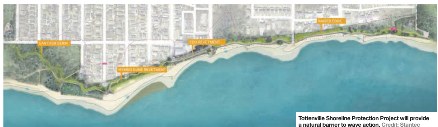
arrier to wave action. Great. Stanted

Globally, work is underway to reverse environmental degradation and the loss of biodiversity, which is damaging economies and long-term survival. Infrastructure and solutions that embrace nature as an integral part of the solution need to be embedded. To offset carbon in its region, Southern Water originally considered more tree planting and it has recently planted 1,400 trees, including rare black poplars and willow to improve biodiversity at various